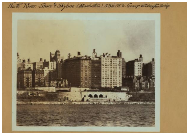
Rotunda and West Side Highway 1937