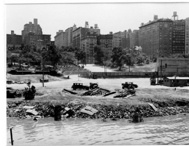
Photo taken from a dock or boat at the current Boat Basin site.

Schwab (CEO of US Steel) Mansion at Riverside Drive Between 73rd and 74 th Streets. The mansion was bequeathed to the City as a residence for the Mayor in 1939, a year after the Basin was built, but LaGuardia turned it down and moved into Gracie Mansion (barf). Today, the entire block is now a red brick apartment building, the Schwab House (double barf).