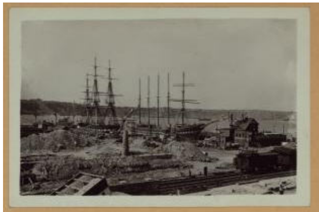
Sailing vessel "Buccaneer" at coal company - 1931